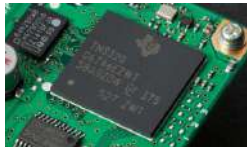
32-bit High Speed Floating Point DSP

The 32 bit high speed floating Point DSP (max 3000 MIPS) provides effective cancellation/reduction (DNR) of the random noise that is frequently frustrating in the HF frequencies. Also: the AUTO NOTCH (DNF) automatically eliminates the dominant beat tone. The CONTOUR, and the APF, are very effective receiver noise reduction tools in the HF bands operations. The YAESU original DSP QRM and noise reduction functions are provided.