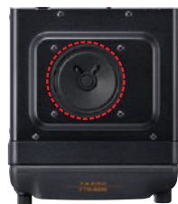
3Watts (66mm) Speaker

A 3W audio speaker ensures clear and crisp sound. The circuit has been specifically tuned for quality audio. You can enjoy communications with outstanding quality audio even in outdoor or noisy environments.